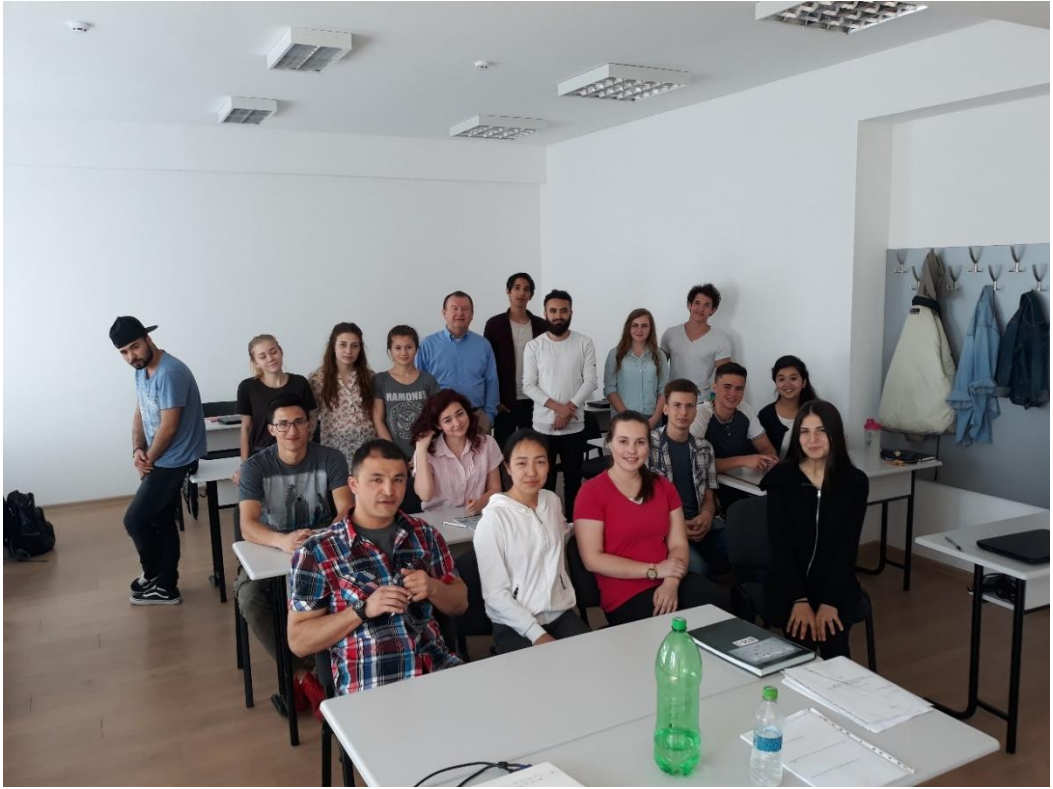
This group of students is majoring in business management. The picture is taken before the exam.