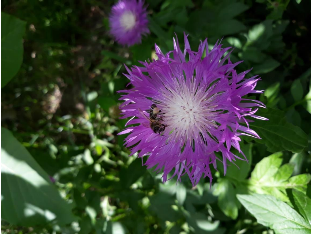
A bee is busy getting nectar from the flower.