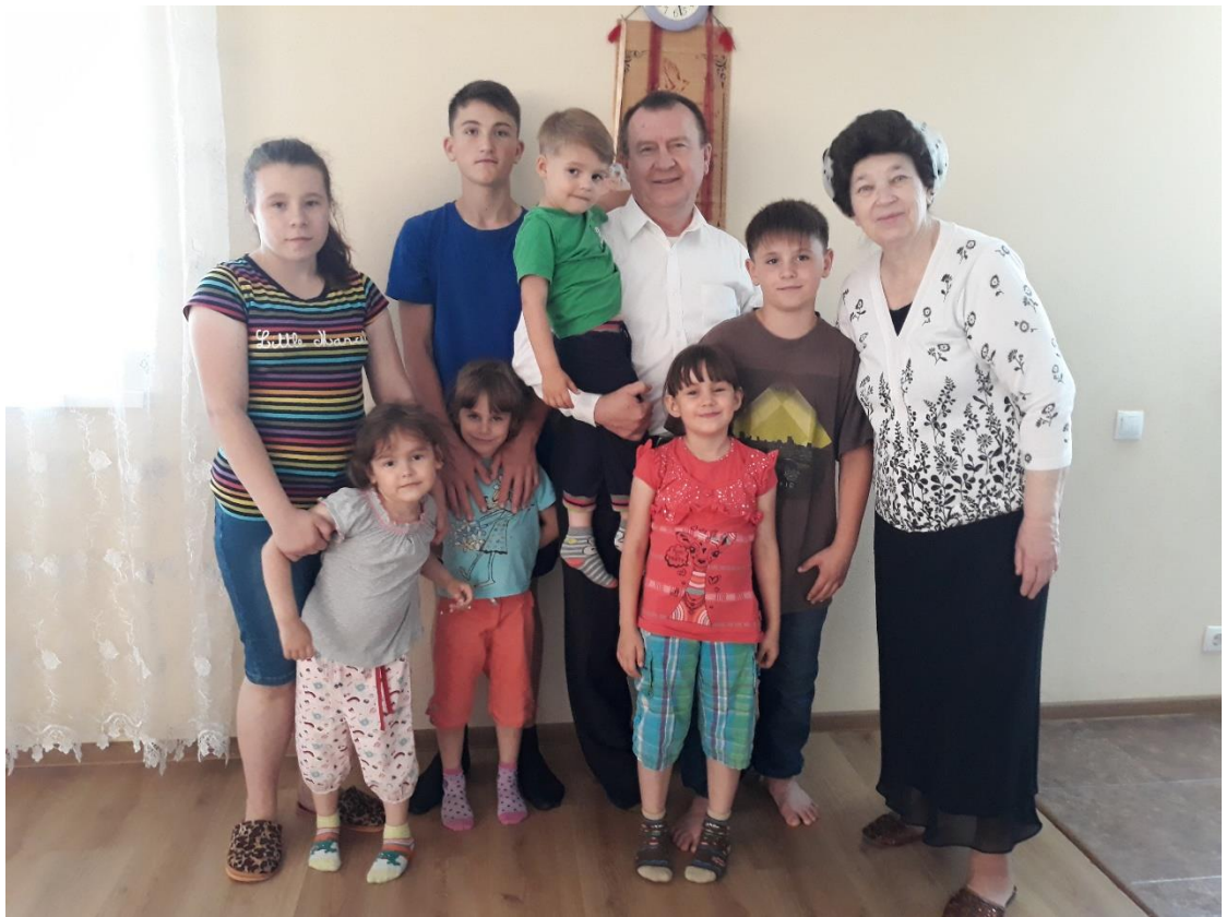
Traditional picture taking before our departure.