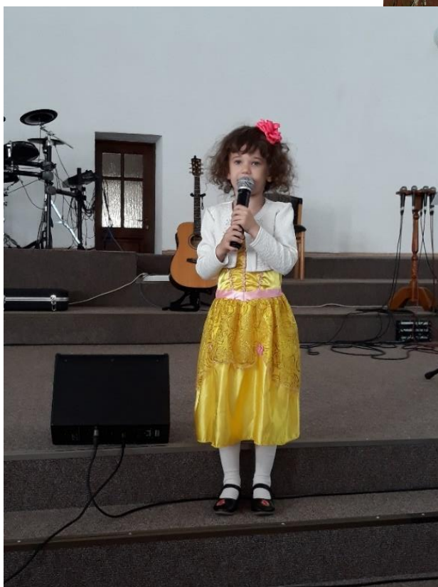
Here is one of the youngest participants of Sunday service. She is singing for the Lord.