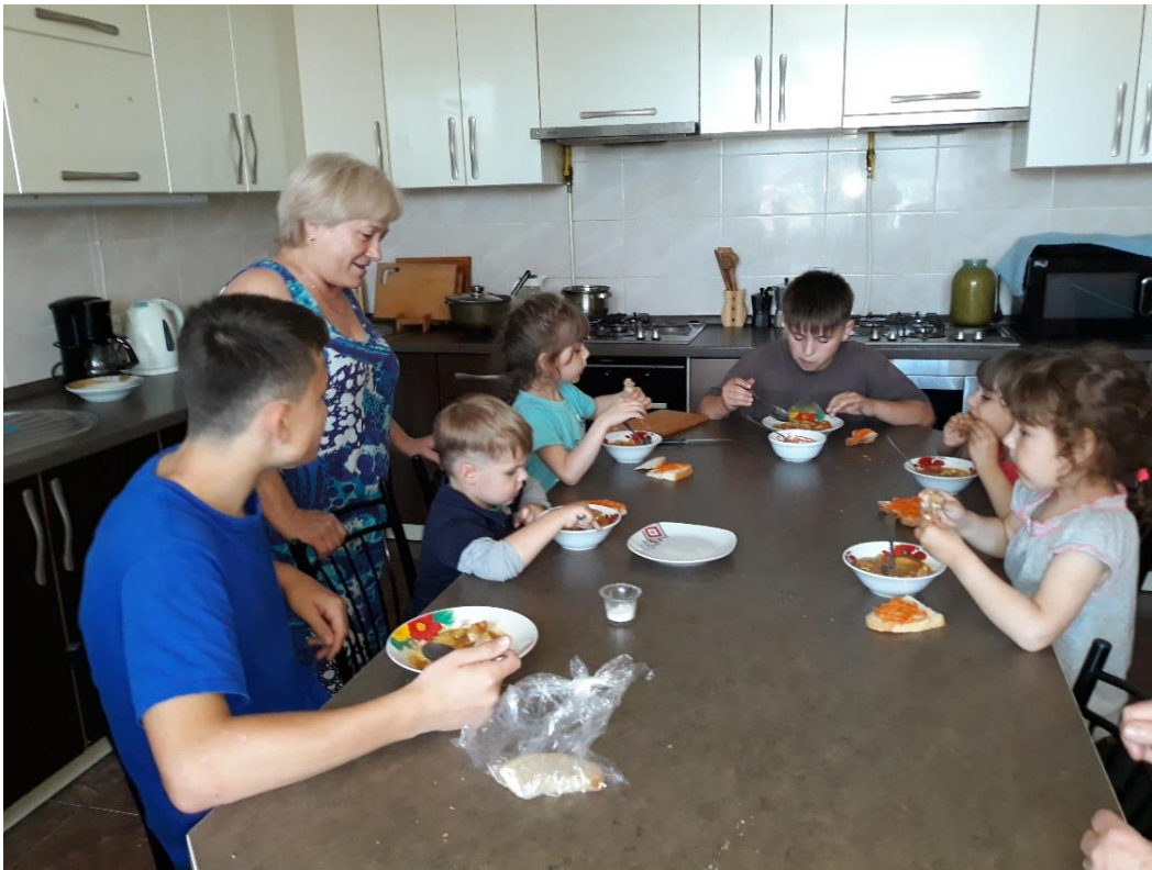
Eating together is making food even tastier!