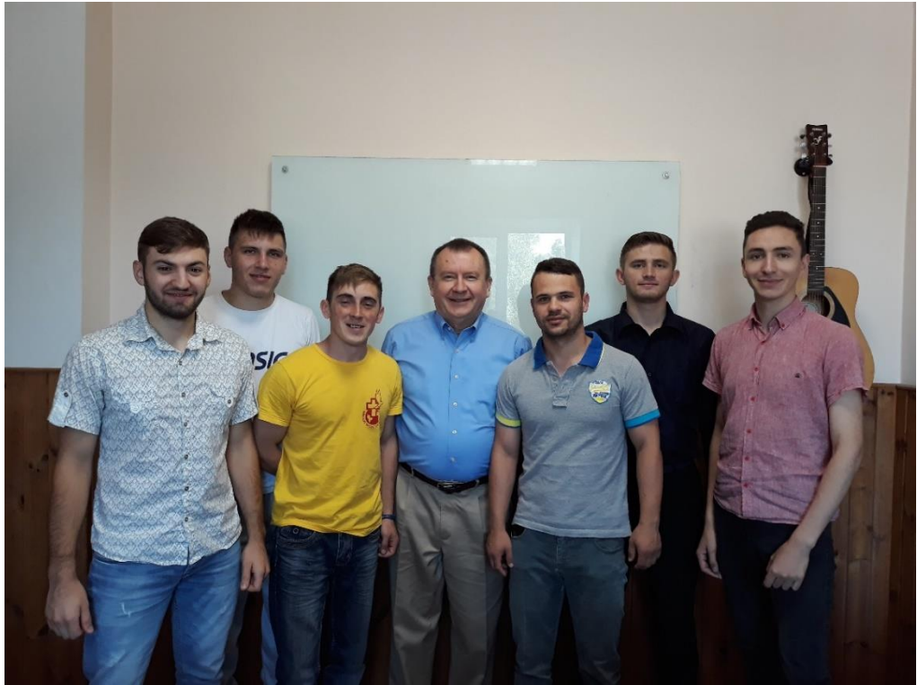
This is my smallest group. Their major is in pastoral ministry. Nice young Moldovan men.