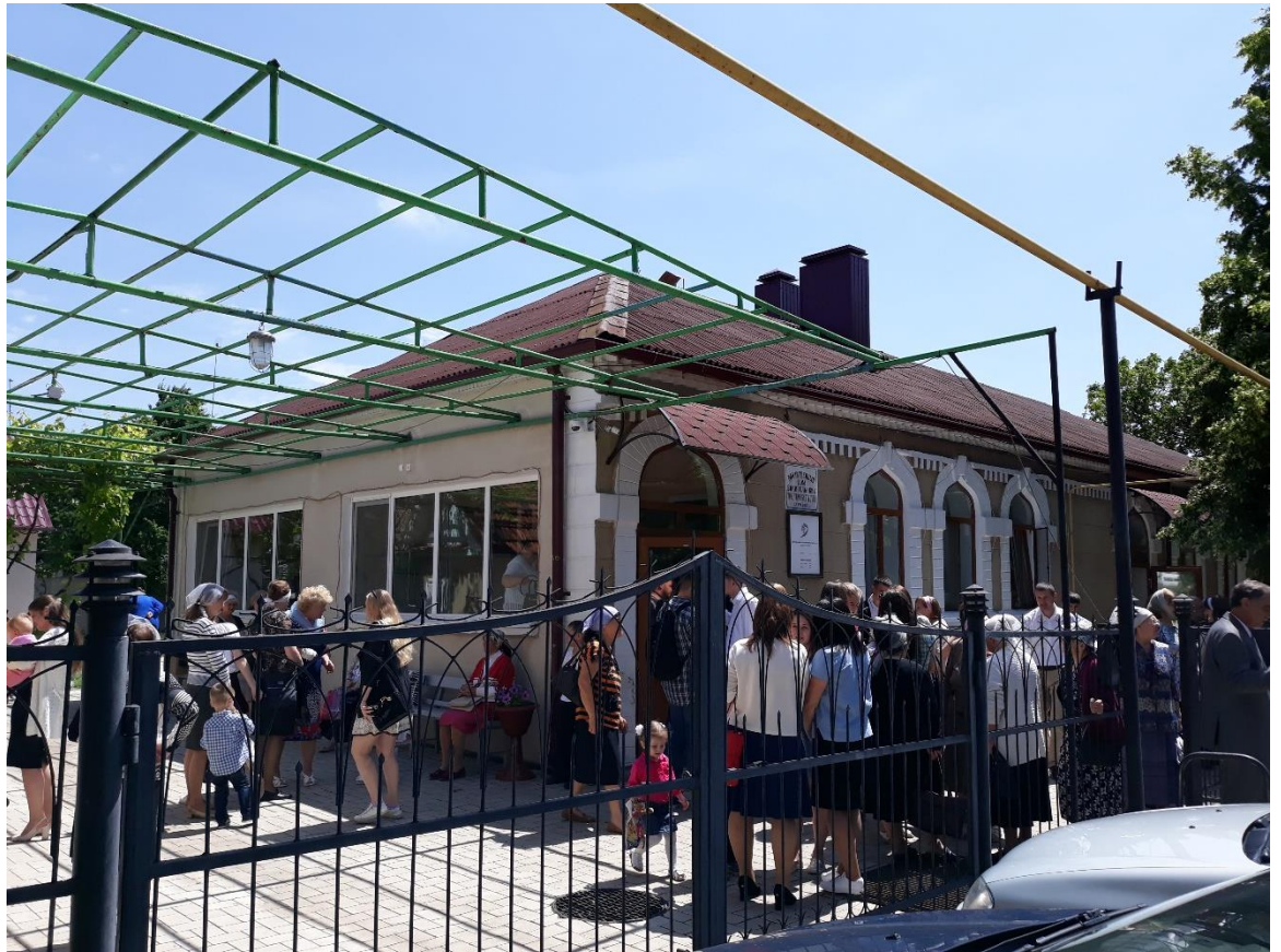
After the end of Sunday service people are not in a hurry to go home. Despite of hot weather they are enjoying each other's company at the church's property.