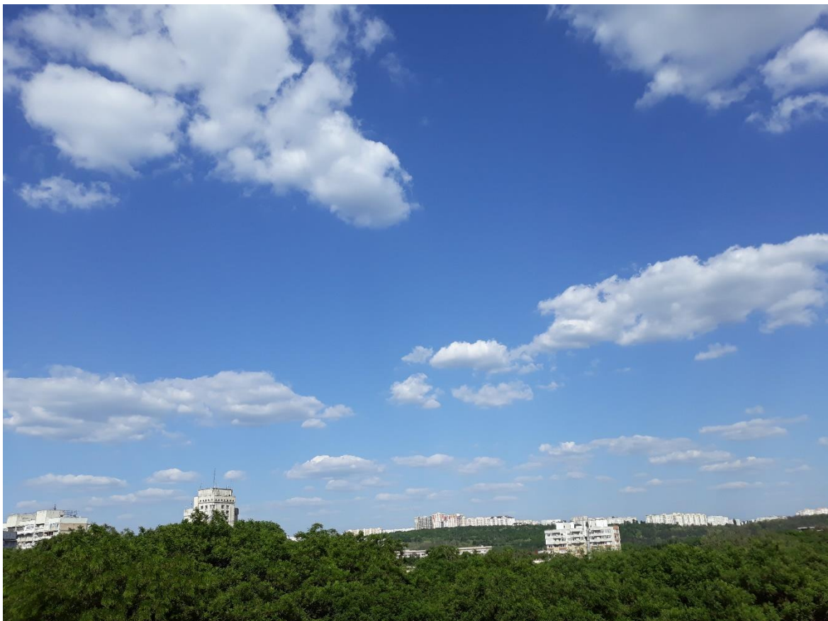
A view from the window of our apartment on the seventh floor.